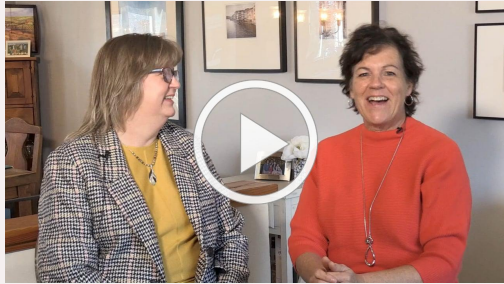
Watch this short interview about the Parent Safety Toolkit. Captioned in English and Spanish.

skills, knowledge and practices that can keep our kids safe and independent.